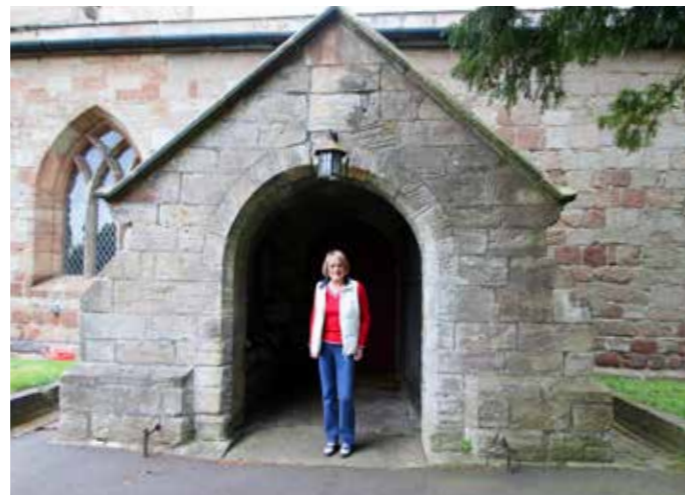
St John the Baptist's Church in Mayfield, East Staffordshire, are working with their local

Several local churches have signed up already and are working towards, or have achieved, the bronze standard, including the Church At Perton in South Staffordshire.